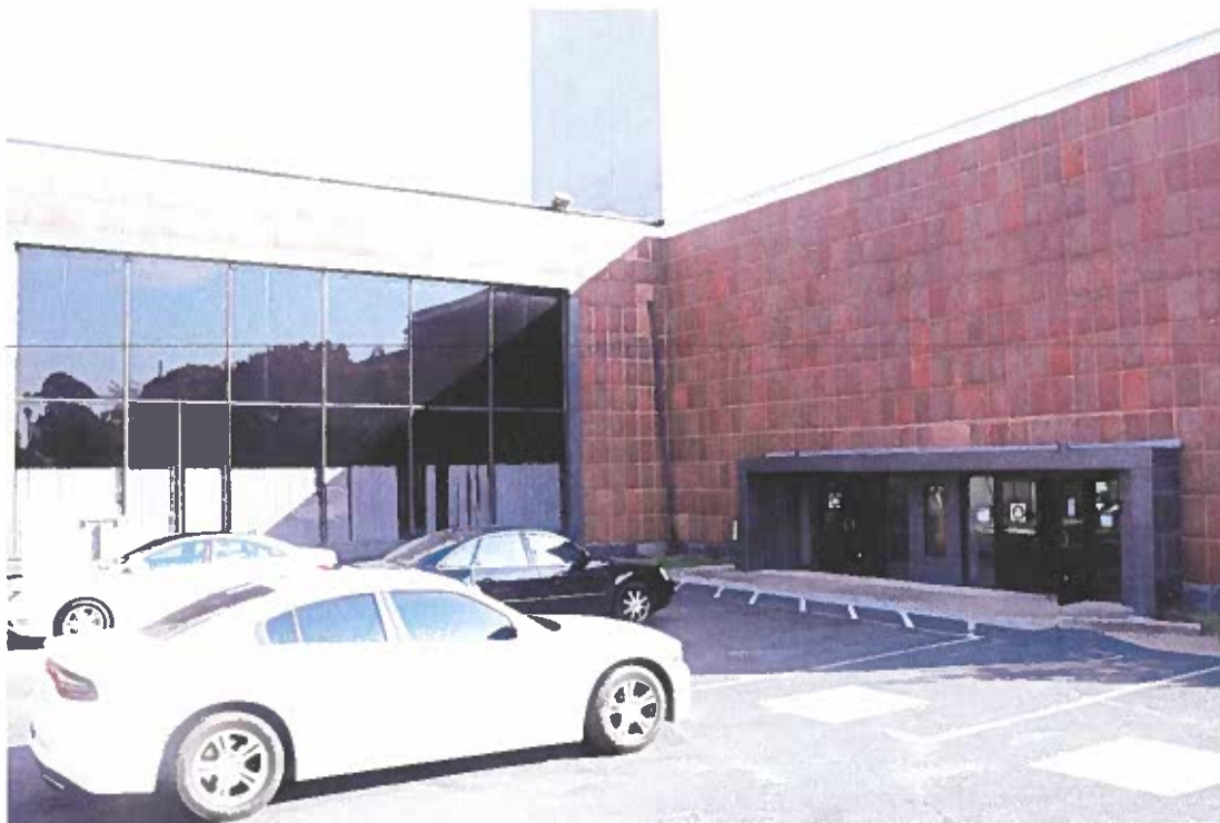
Photo 12. View of entrance to arts building on northwest facade, looking east, Belgian Building, 11/17/21