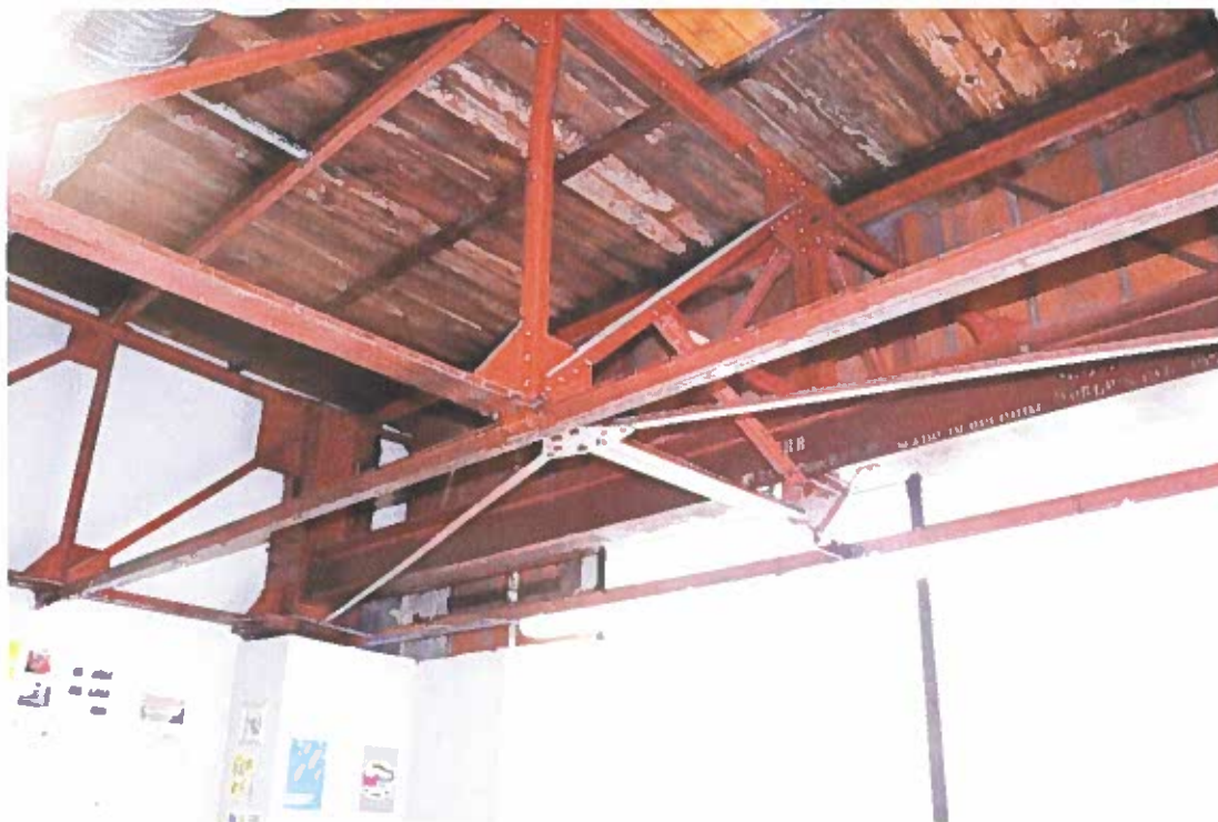
Photo 18. Detail of steel trusses on second floor of arts building, Belgian Building, 11/17/21