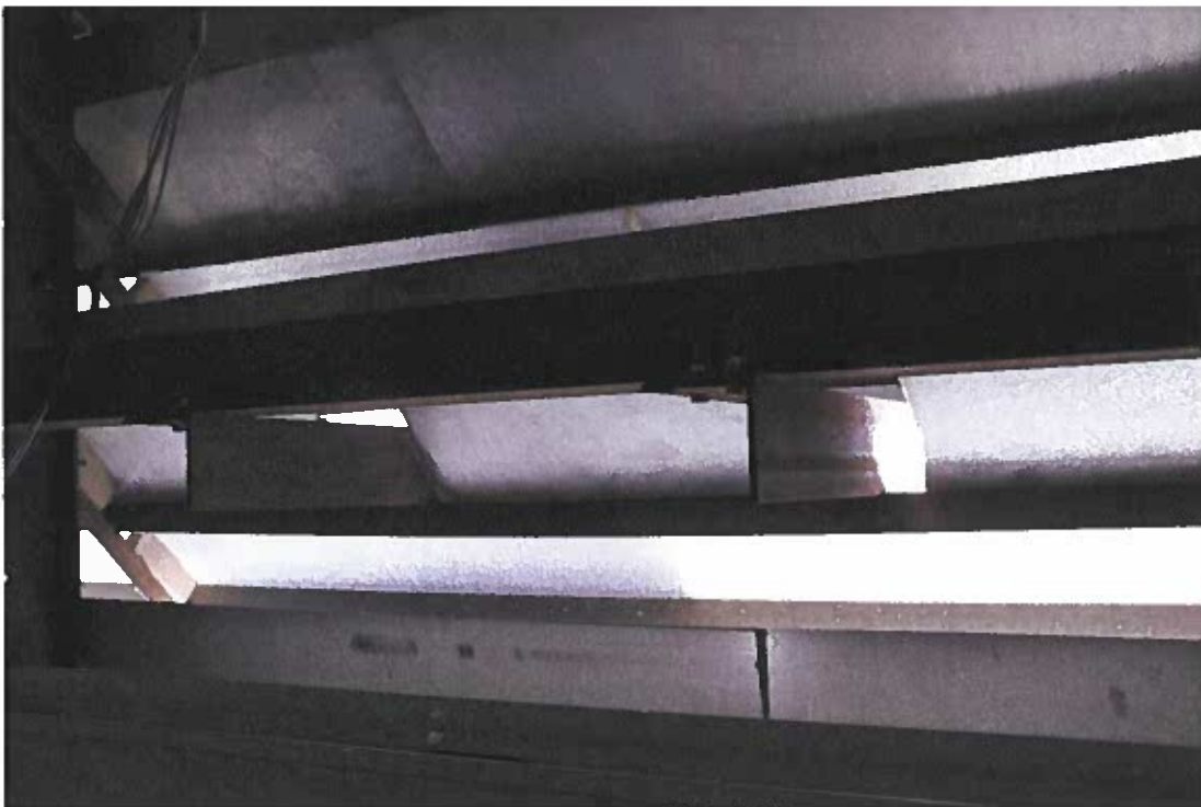
Photo 22. Detail of signage support beams and louvers, Belgian Building, 11/17/21