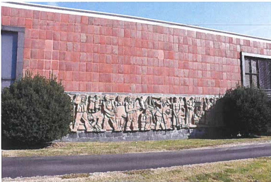
Photo 10. View of bas-relief panel on southwest façade of arts building, looking northeast, Belgian Building, 11/17/21