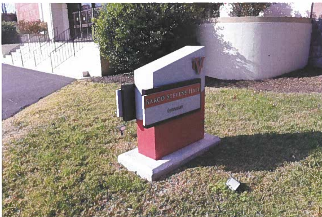
Photo 16. View of new signage near northeast corner of field house/gymnasium building,, Belgian Building, 5/23/19