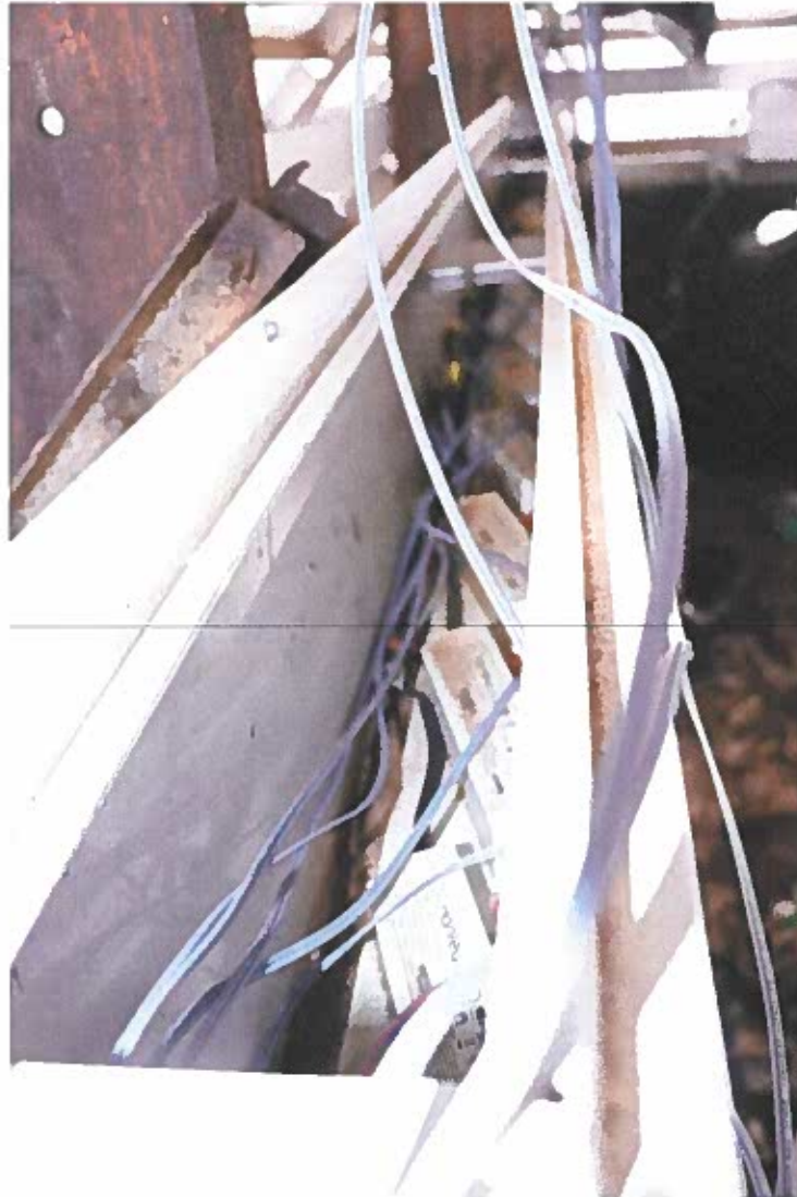
Photo 23. Detail of electrical wiring box located at base of each signage support structure, Belgian Building, 11/17/21