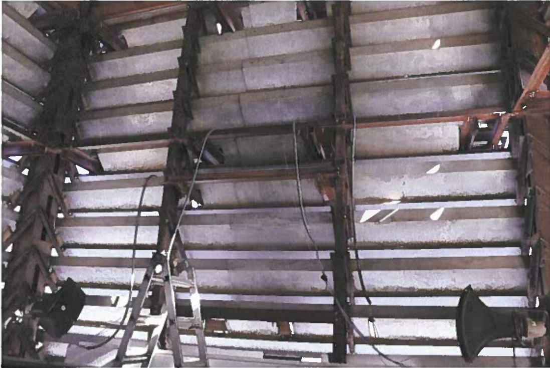
Photo 21. Detail of new signage mounts at top of bell tower, Belgian Building, 11/17/21