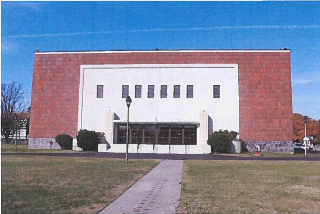
Photo 1. Southeast elevation of field house/gymnasium, looking northwest, Belgian Building, 11/17/21