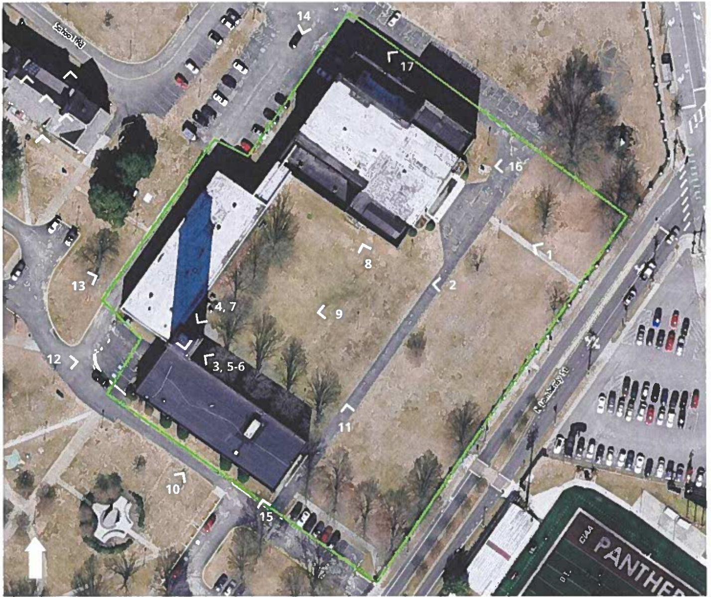
127-0173_ep Belgian Building Photopoint Map