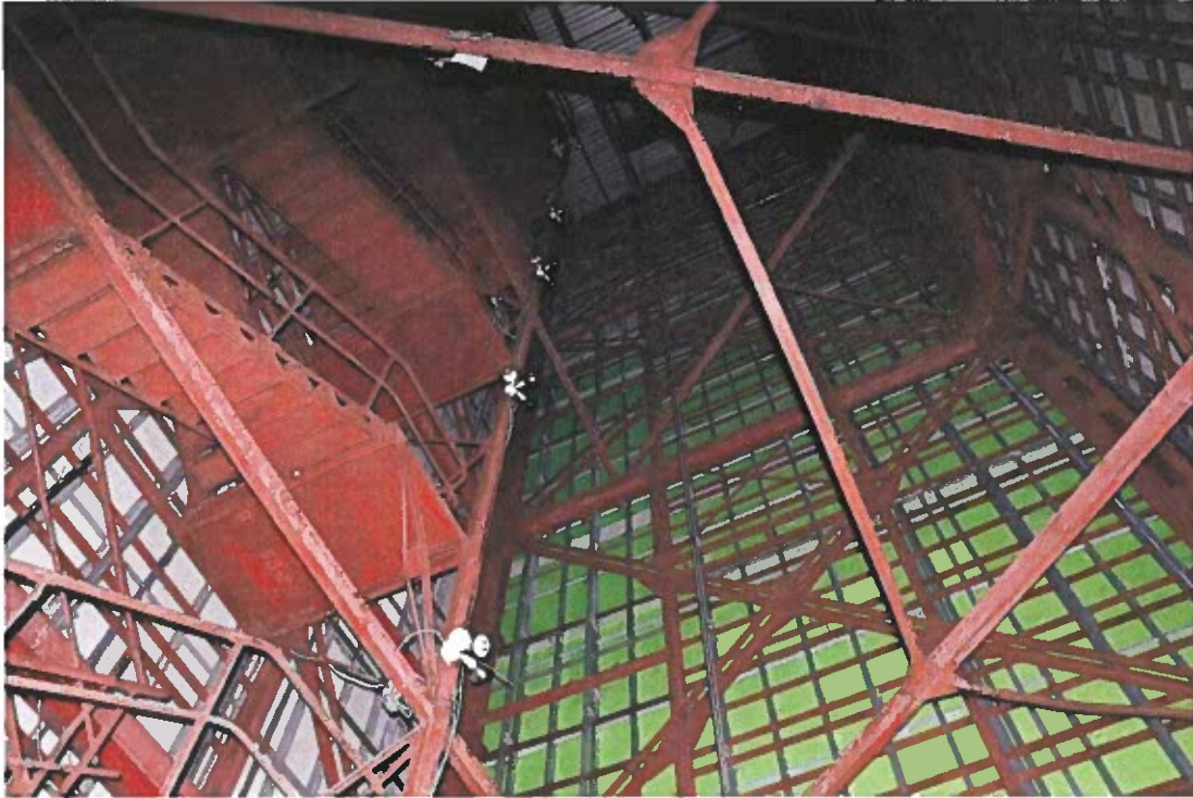
Photo 19. Upward view of bell tower structure from base, Belgian Building, 11/17/21