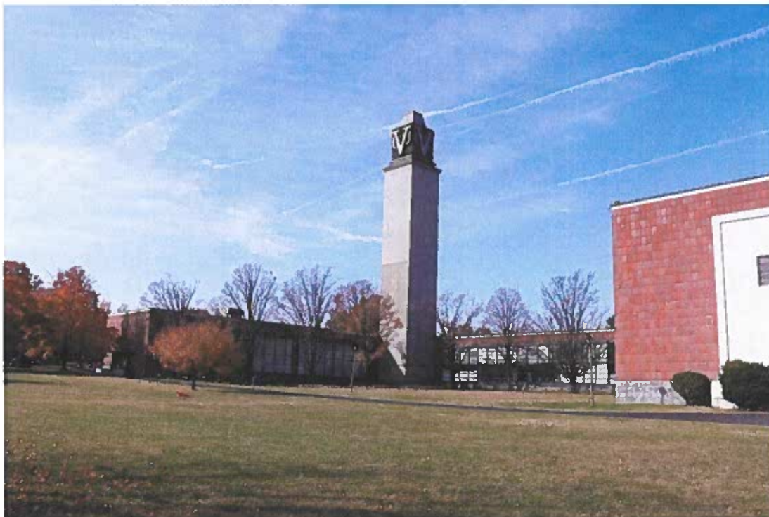
Photo 2. View of courtyard and tower, looking northwest, Belgian Building, 11/17/21