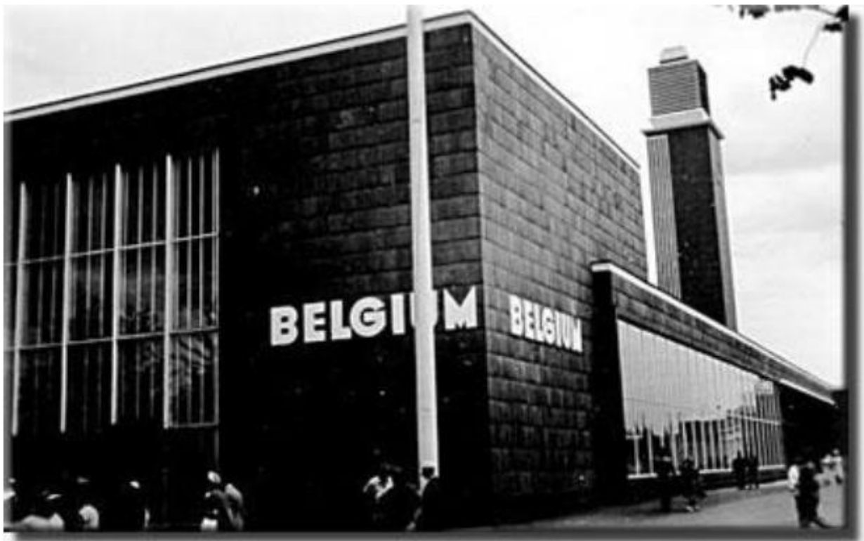
Belgian Friendship Pavilion, 1939 New York World's Fair

July 31, 2024 Scaffolding removal begins. Repairs continue.