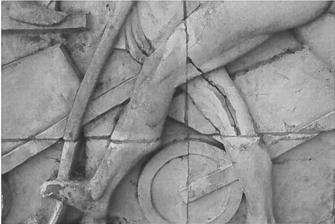
Photo 5. Detail of typical deterioration on bas-relief panel, Belgian Building, 11/17/21