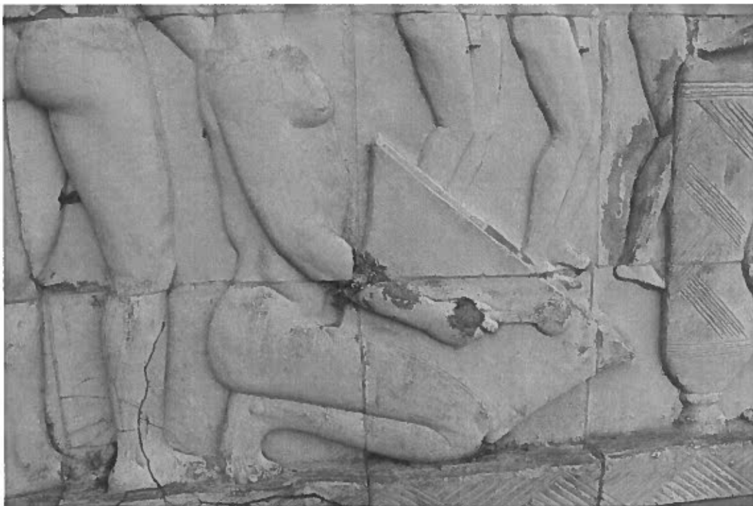
Photo 6. Detail of typical deterioration on bas-relief panel, Belgian Building, 11/17/21