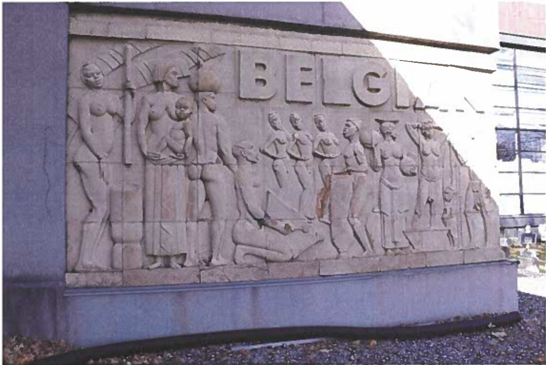
Photo 3. Detail of southeast facing panel on tower base, Belgian Building, 11/17/21