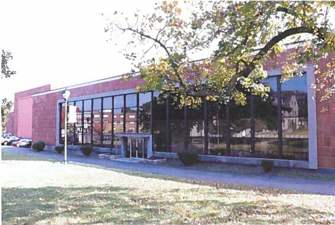
Photo 13. View of entrance to exercise/training facility on northwest facade, looking east, Belgian Building, 11/17/21