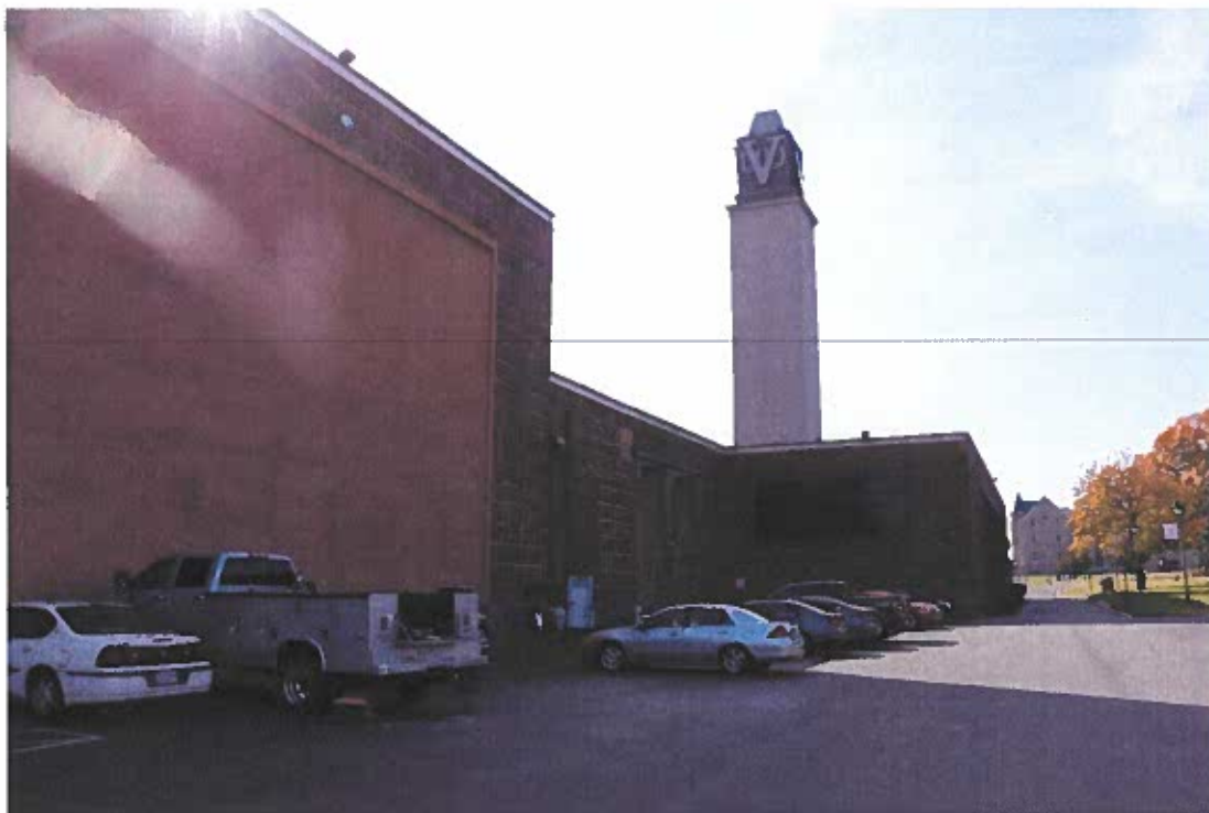
Photo 14. View along northwest façade, looking west-southwest, Belgian Building, 11/17/21