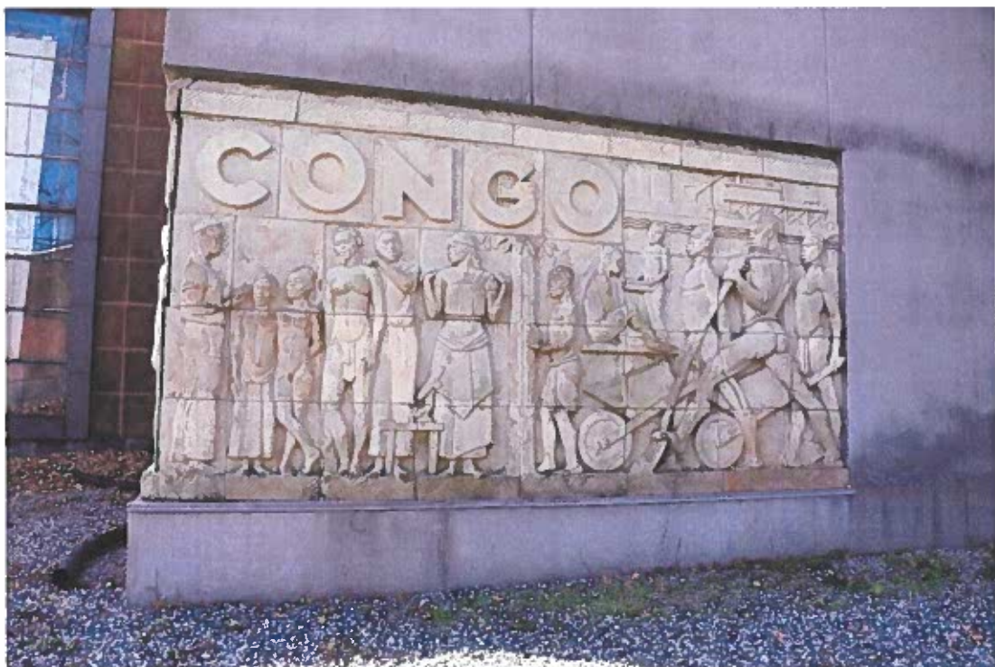
Photo 4. Detail of northeast facing panel on tower base, Belgian Building, 5/23/19