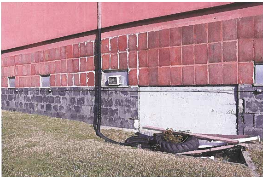
Photo 8. Detail of tile repair on southwest façade of gymnasium building, Belgian Building, 11/17/21