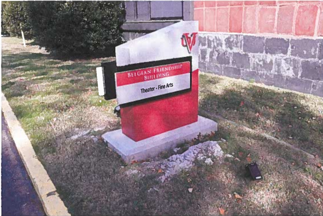
Photo 15. View of new signage near southern corner of arts building, Belgian Building, 11/17/21