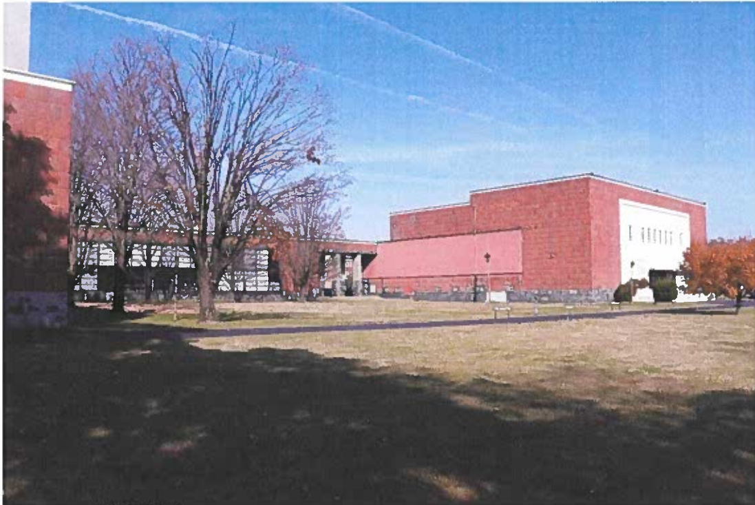
Photo 11. View of courtyard and gymnasium building, looking north, Belgian Building, 11/17/21