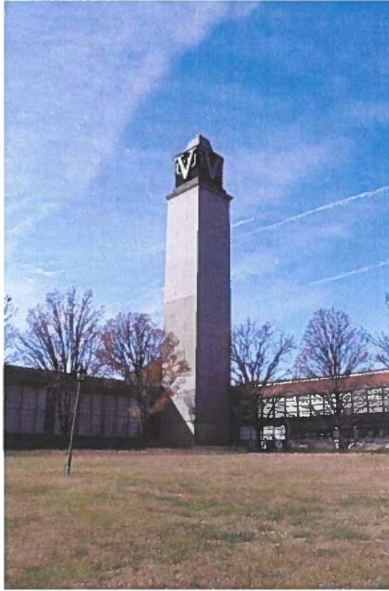
Photo 9. View of bell tower with signage, looking west, Belgian Building, 11/17/21