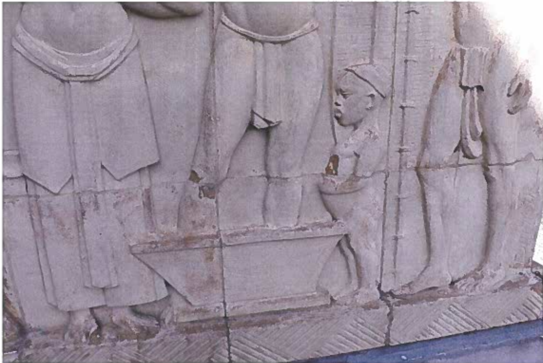
Photo 7. Detail of typical deterioration on bas-relief panel, Belgian Building, 11/17/21