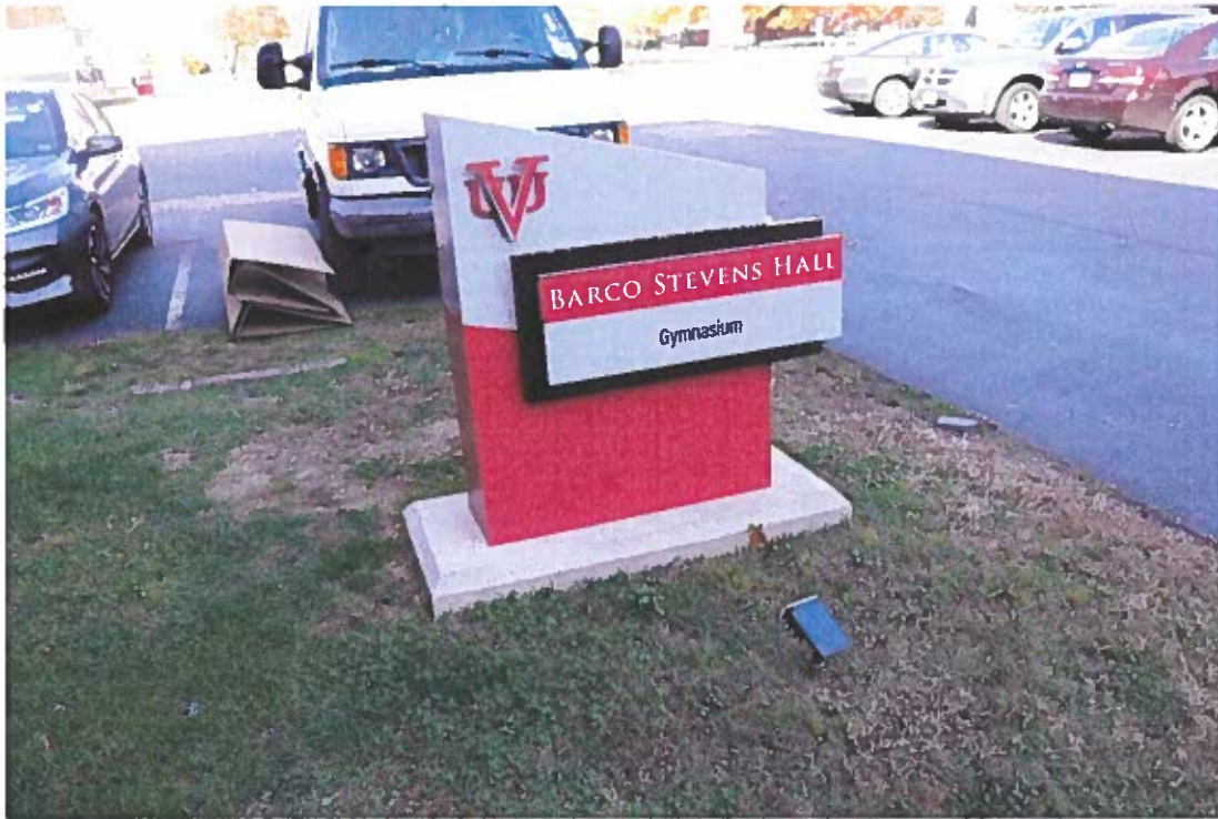
Photo 17. View of new signage near northern corner of field house/gymnasium building, Belgian Building, 11/17/21