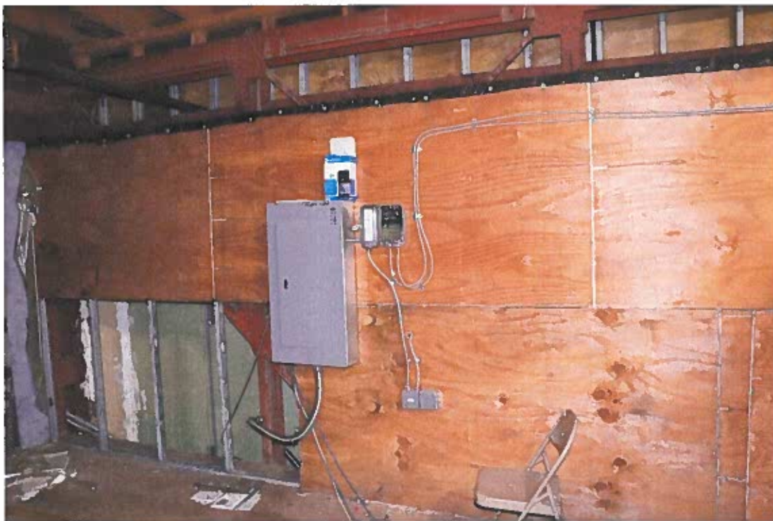
Photo 20. Electrical junction box for illuminated signage (located at base of bell tower), Belgian Building, 11/17/21